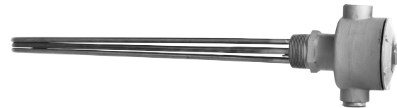
E2 — Dimensions (Inches)